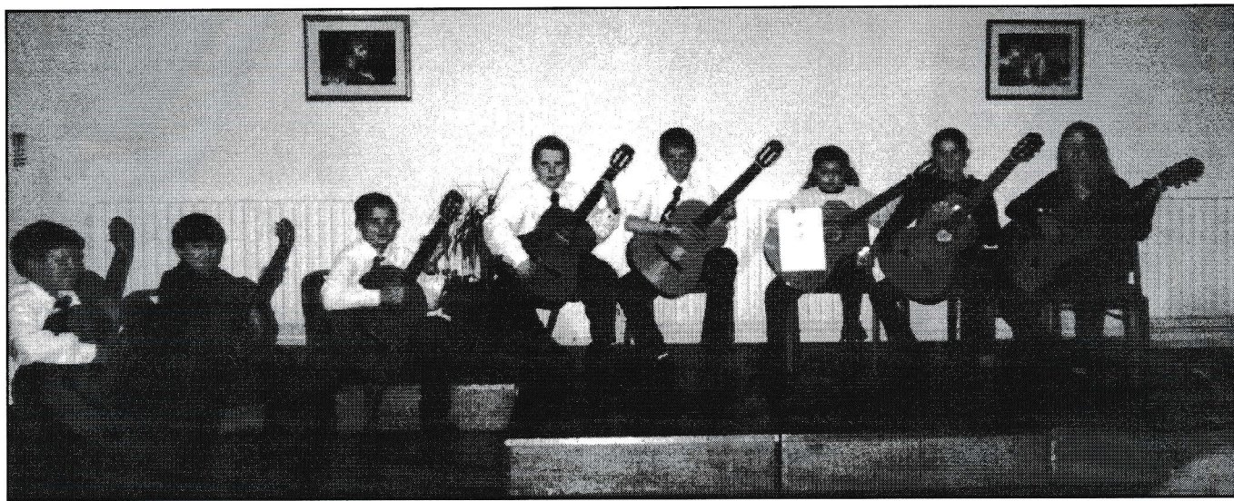
Chichester Junior Ensemble score at Worthing Festival

F or the first time in many years the guitar classes in the Worthing Festival did not have any students from the Rikkyo School taking part because their exams had been moved forward. Despite this we had a most enjoyable day - plenty of interesting performances and several new faces.