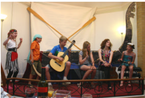
A motley crew of drunken sailors!

The Mediaeval Summer Party some 15 years ago. How come age has not wearied them?