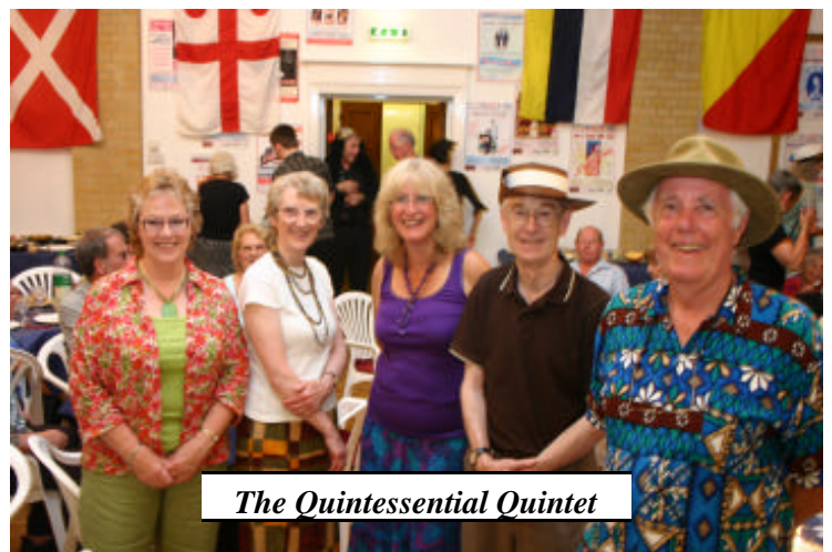
The Quintessential Quintet