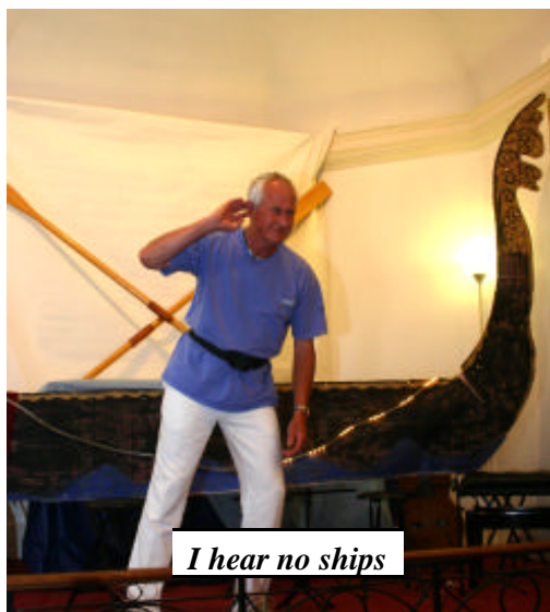
I hear no ships