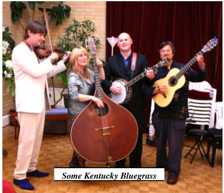
Some Kentucky Bluegrass