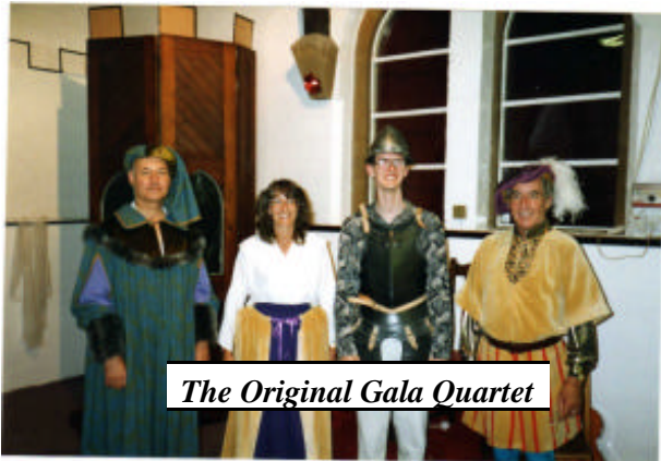
The Original Gala Quartet