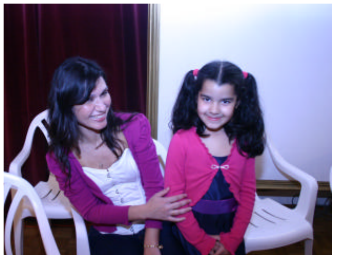
Cirella & Cissyle