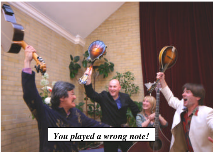
You played a wrong note!