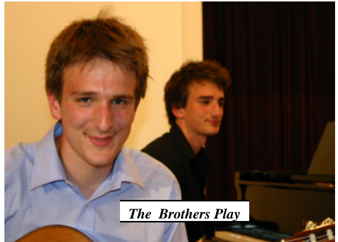
The Brothers Play