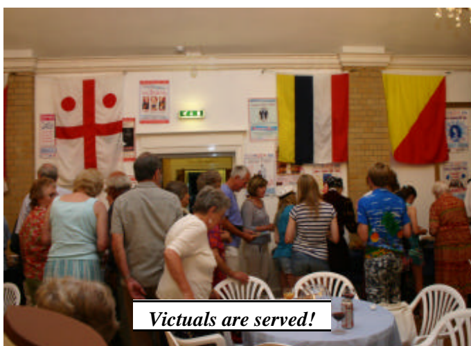
Victuals are served!