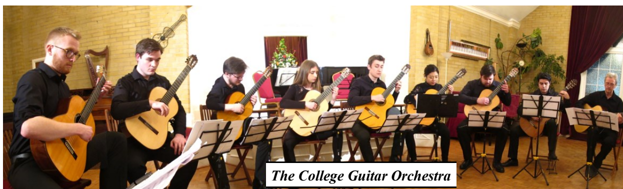
The College Guitar Orchestra