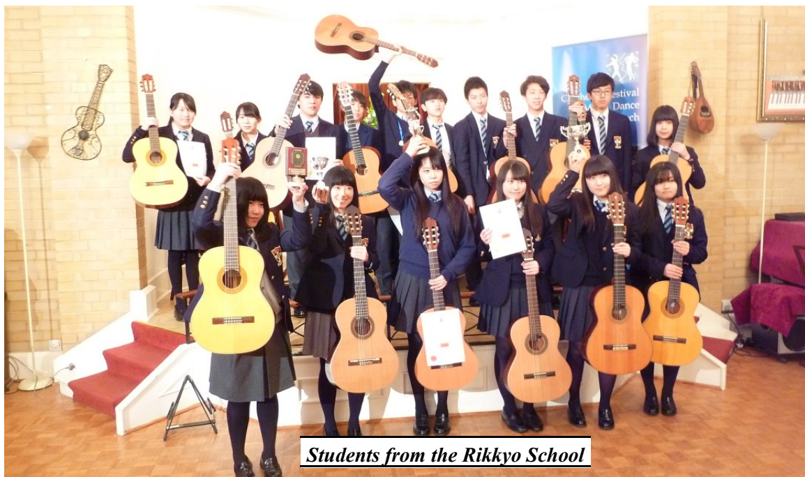
Students from the Rikkyo School