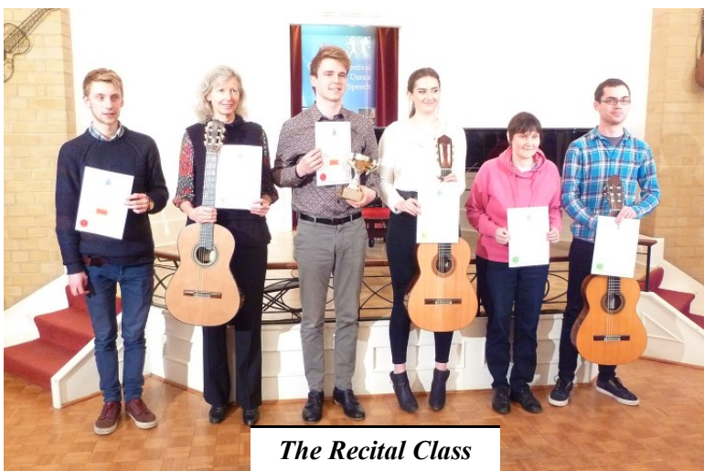
The Recital Class