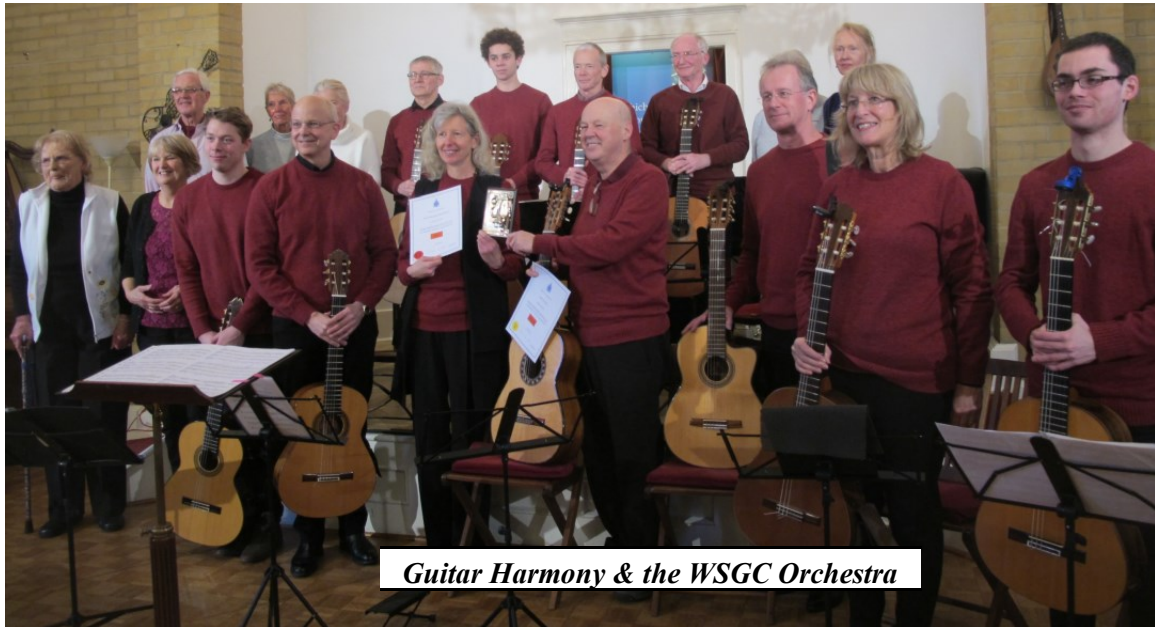
Guitar Harmony & the WSGC Orchestra