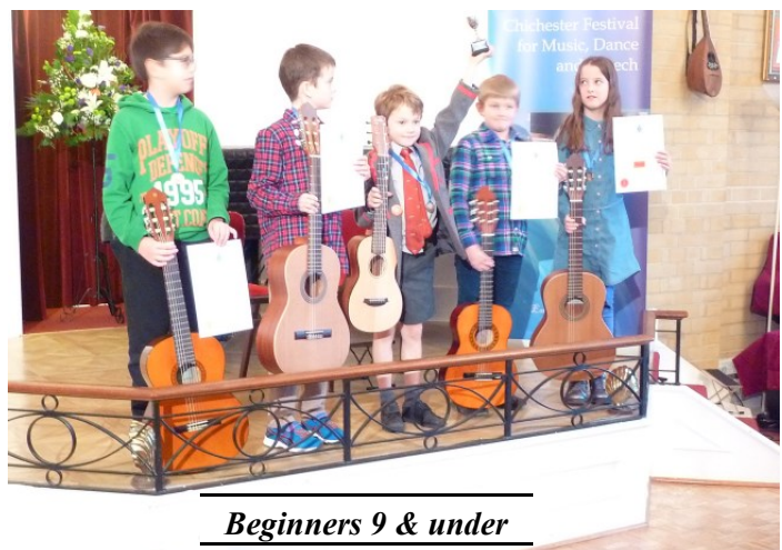
Beginners 9 & under