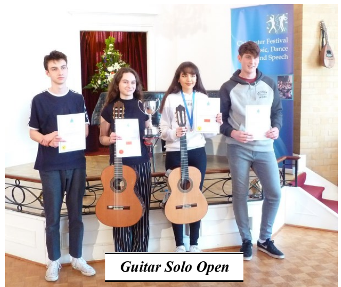
Guitar Solo Open